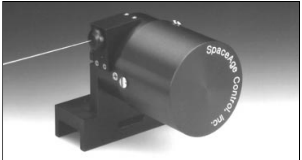
SpaceAge Control position transducers offer reliability, quick installation, flexible mounting, and varied electrical outputs for flight data recorder use.

The award winners will be selected by a panel of independent judges who represent a cross-section of the aerospace industry. The awards will be announced in the May 10, 1999 issue of Aviation Week & Space Technology . □