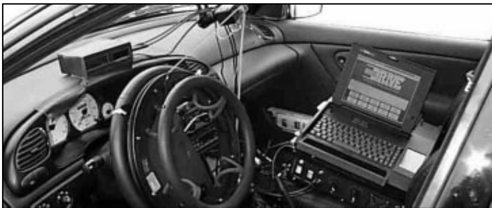
"In-vehicle" means in-vehicle! Ford's DIVAS system is designed so all data acquisition, processing, and analysis can be performed without bulky support equipment or support vehicles.

The developed system is called DIVAS (Development In-Vehicle Acquisition System) within the Ford development community. Datepli markets the system as the DRIVE (Data Retrieval In-Vehicle) Data Acquisition System. Currently, there are approximately 50 systems in use by Ford in North America, Europe, and Australia. There are also nearly a dozen systems in use by companies other than Ford. Many benefits have been achieved through the use of the system and the applications keep growing. These include CAE model correlation, driver training, and Design of Experiments. In addition, engineers worldwide have been able to