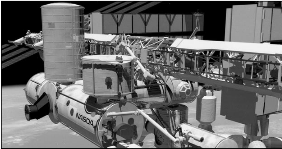
The FC-72 accumulator developed by TRW and EG&G Belfab is located on the Exposed Facility (EF) of the Japanese Experiment Module (JEM).