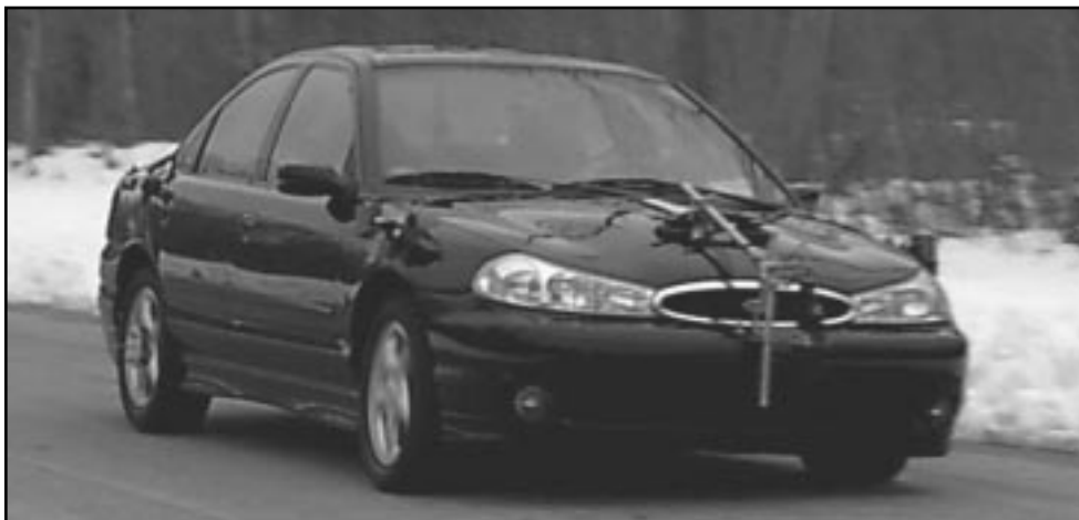
A Ford vehicle with the DIVAS system installed. Note the four SpaceAge Control position transducers mounted on each quarter panel.

When all channels have been set up and tested, the user is ready to begin data acquisition. This is the point at which they enter the log sheet for the particular test they are performing. A log sheet consists of various run types with which each data file may be associated. For example, a lane change test may have among its run types a 45 MPH run