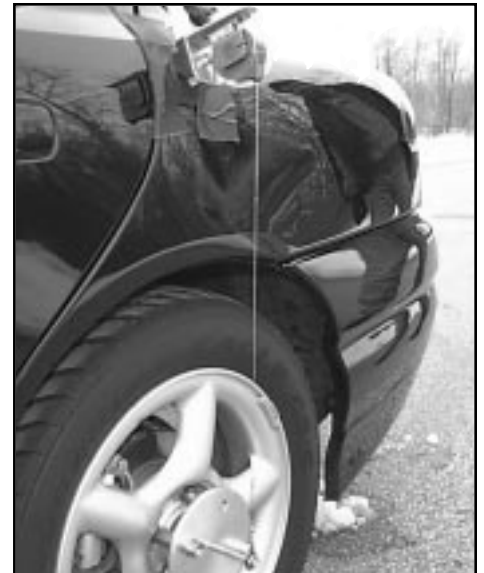
The SpaceAge Control Model 161-1283 position transducer shown feeds suspension displacement data to the Ford DIVAS data acquisition system. The transducer is mounted via a suction cup mount.

The DIVAS hardware consists of a rugged laptop made by Fieldworks, Inc. mounted on top of a signal conditioning unit. A cable